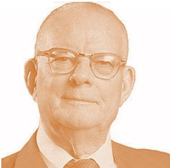
Dr. Edward Deming